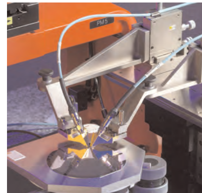
Testing HF on PM5 (for small budgets)