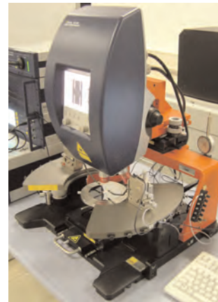
MEMS testing with SUSS PM5 and Polytec MSA 400